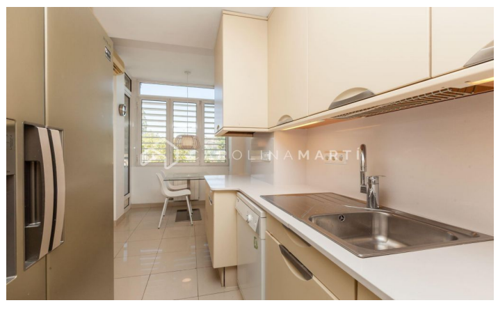
Contact us for more information or to arrange a viewing

Tel: +34 93 241 10 95 <u>info@carolinamarti.com</u> <u>www.carolinamarti.es</u>